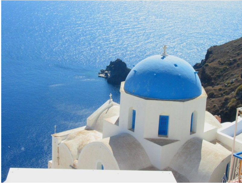
One of Santorini's famous churches